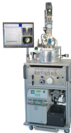
GHA 350 with 3 cameras in compact trolley