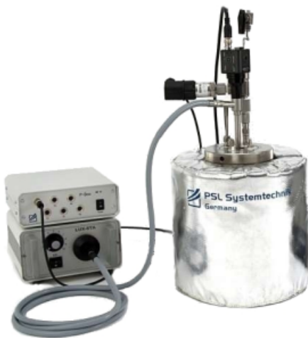
Gas Hydrate Autoclave GHA 200

Up to 6 hydrate cells can be operated simultaneously via PC software. With boroscope cameras gas hydrate formation can be visually observed. The GHA 200 has one top view camera or alternatively an overhead stirrer, the GHA 350 offers three cameras (1 top view, 2 side views at different heights) and simultaneously the overhead stirrer. Photos and videos can be taken during tests. For sour gas testing all autoclaves are available as Hastelloy® model including all wetted parts.